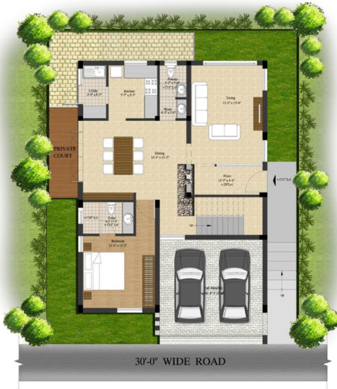
TYPE -A SOUTH FACING GROUND FLOOR