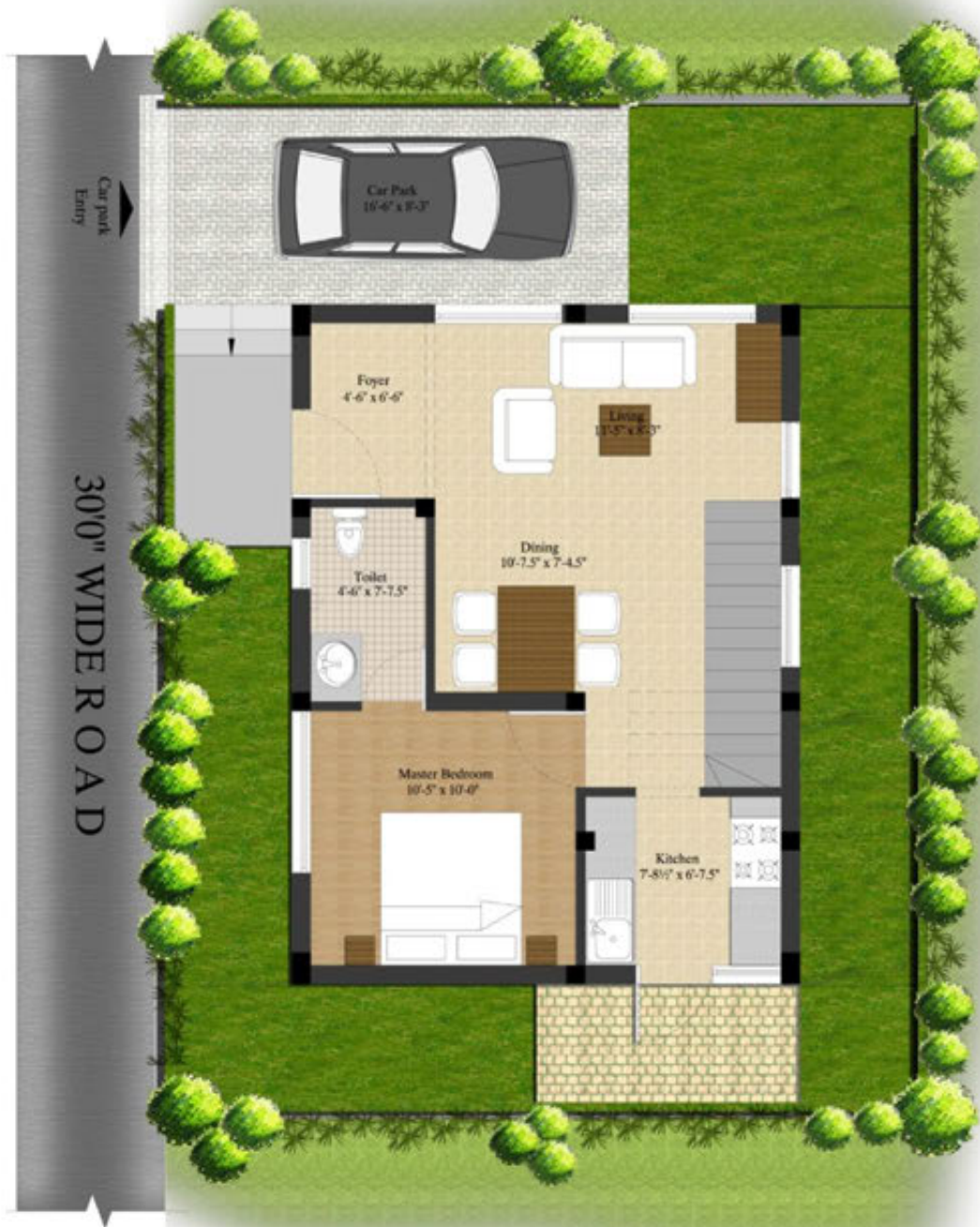
TYPE -E WEST FACING GROUND FLOOR