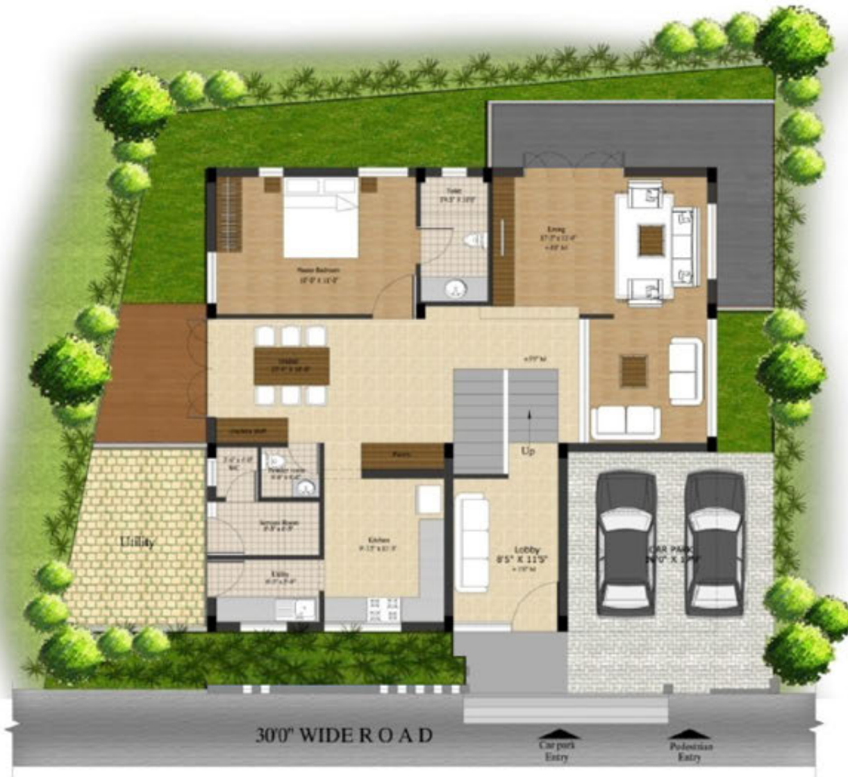
TYPE -C EAST FACING GROUND FLOOR