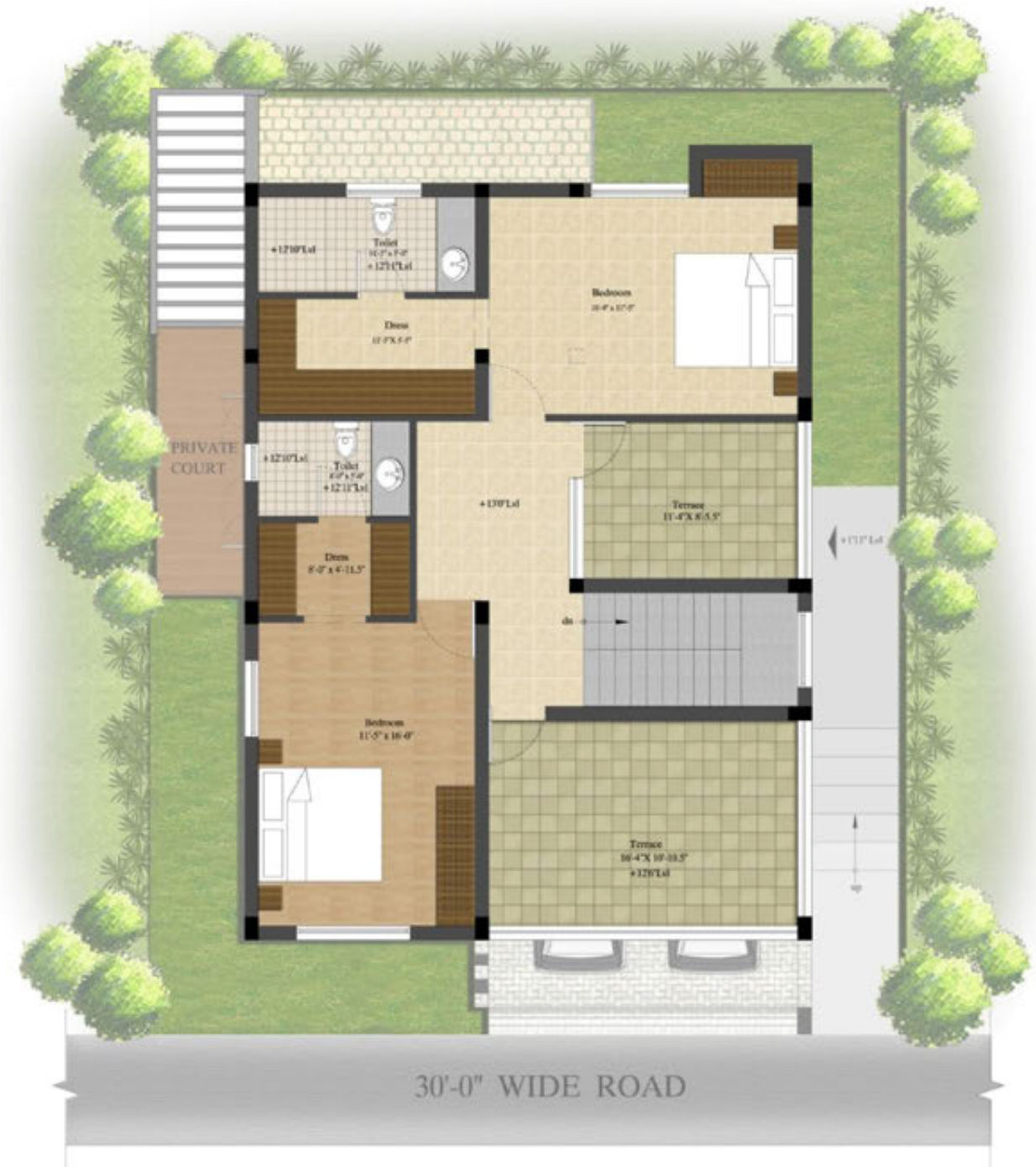
TYPE -A SOUTH FACING FIRST FLOOR