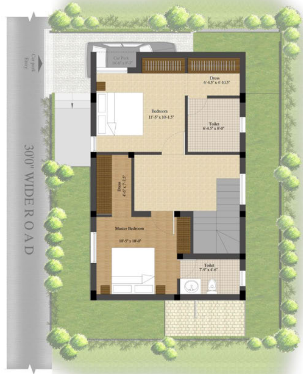
TYPE -E WEST FACING FIRST FLOOR