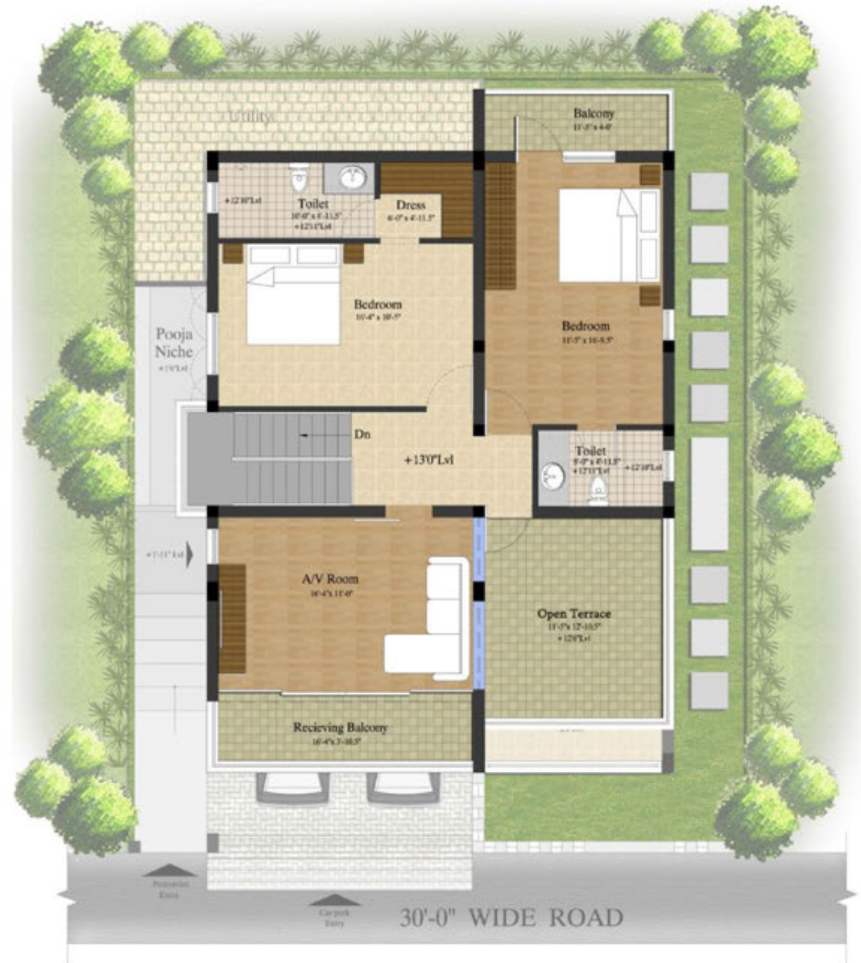
TYPE -A NORTH FACING FIRST FLOOR