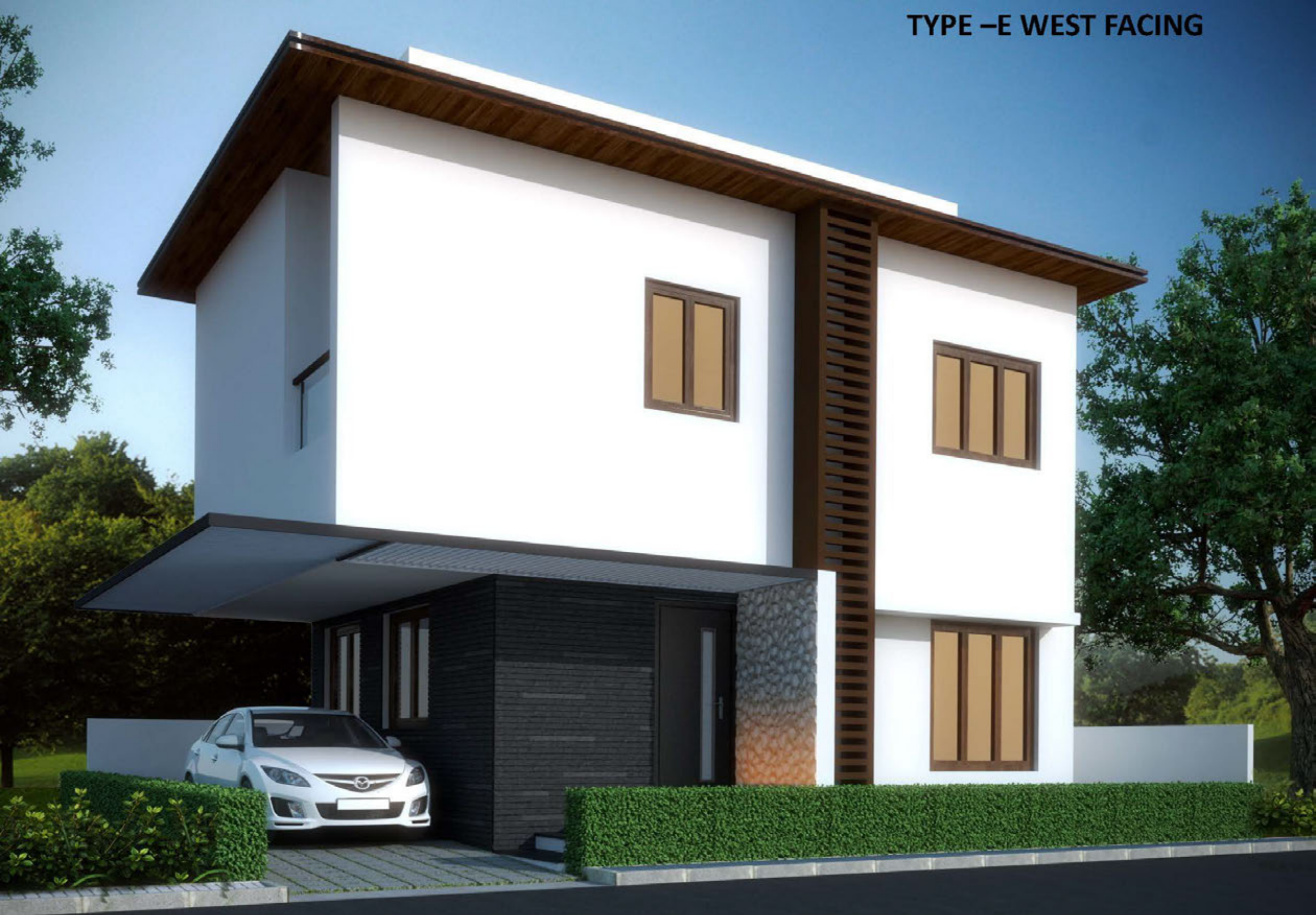
TYPE –E WEST FACING