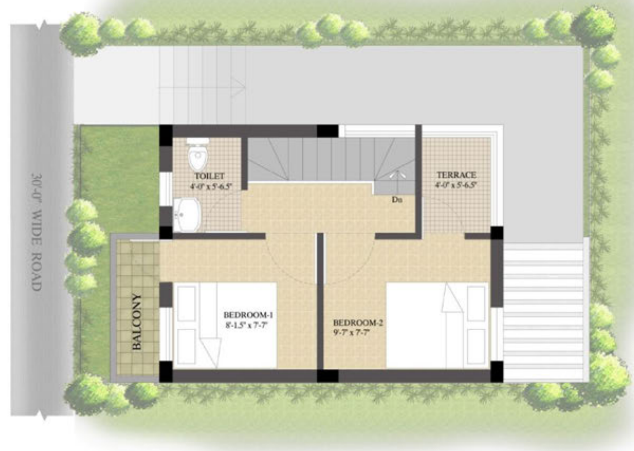
TYPE -E1 WEST FACING FIRST FLOOR