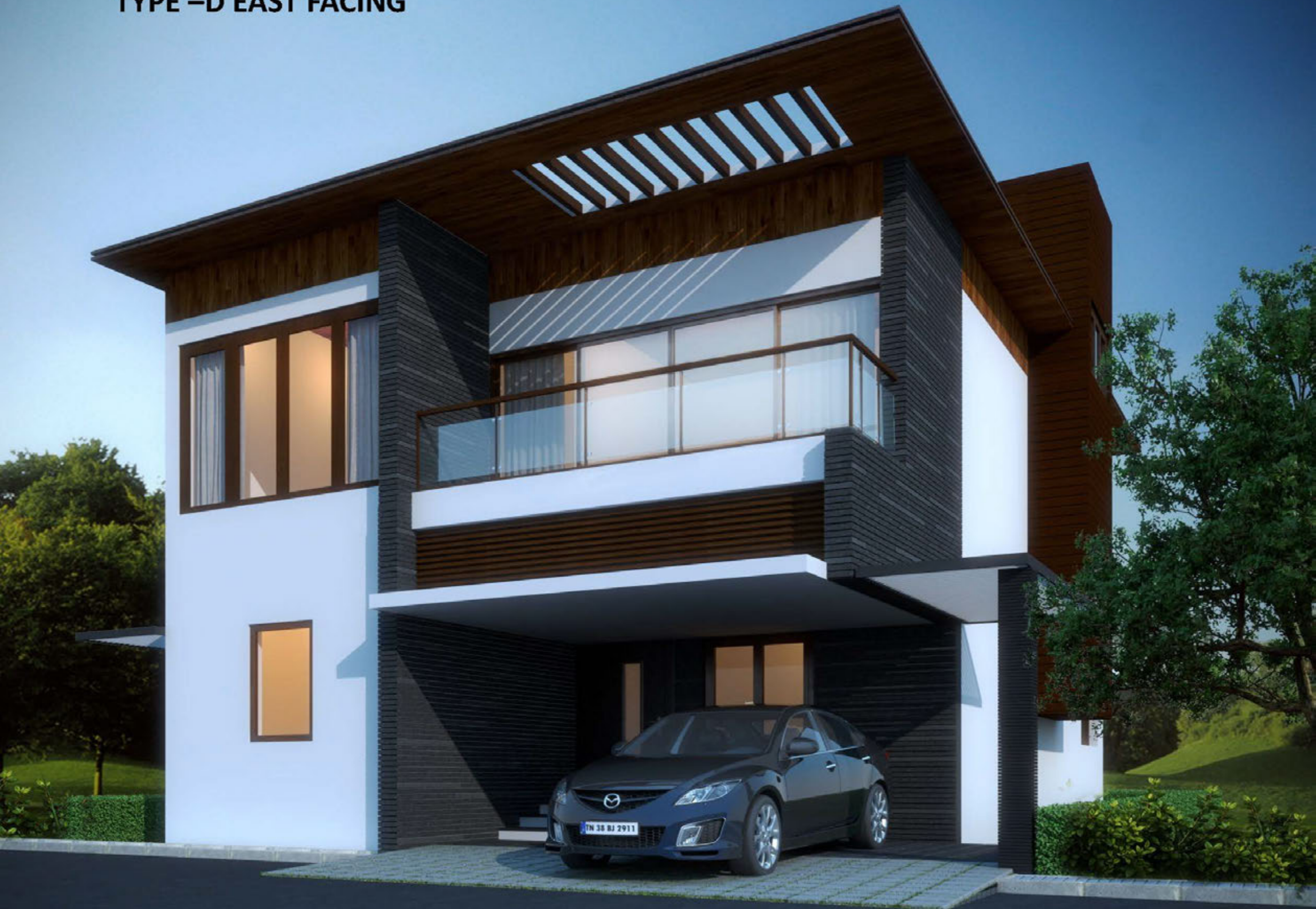
TYPE -D EAST FACING