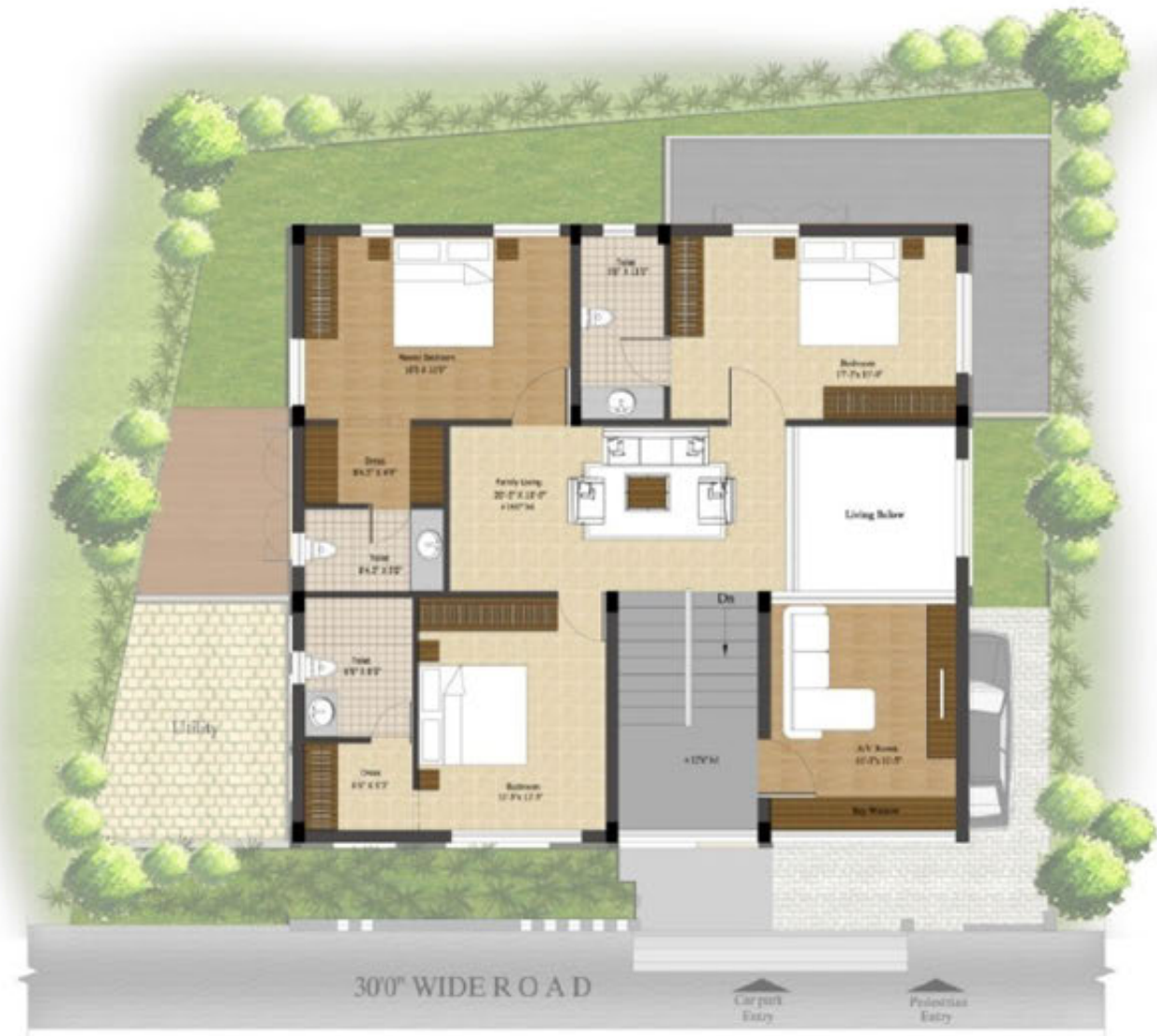
TYPE -C EAST FACING FIRST FLOOR