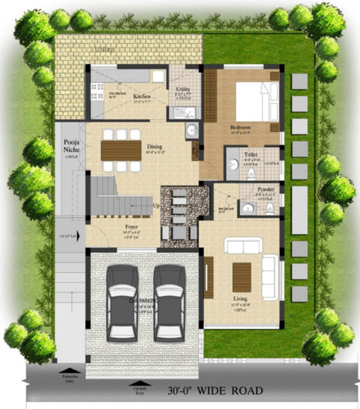
TYPE -A NORTH FACING GROUND FLOOR