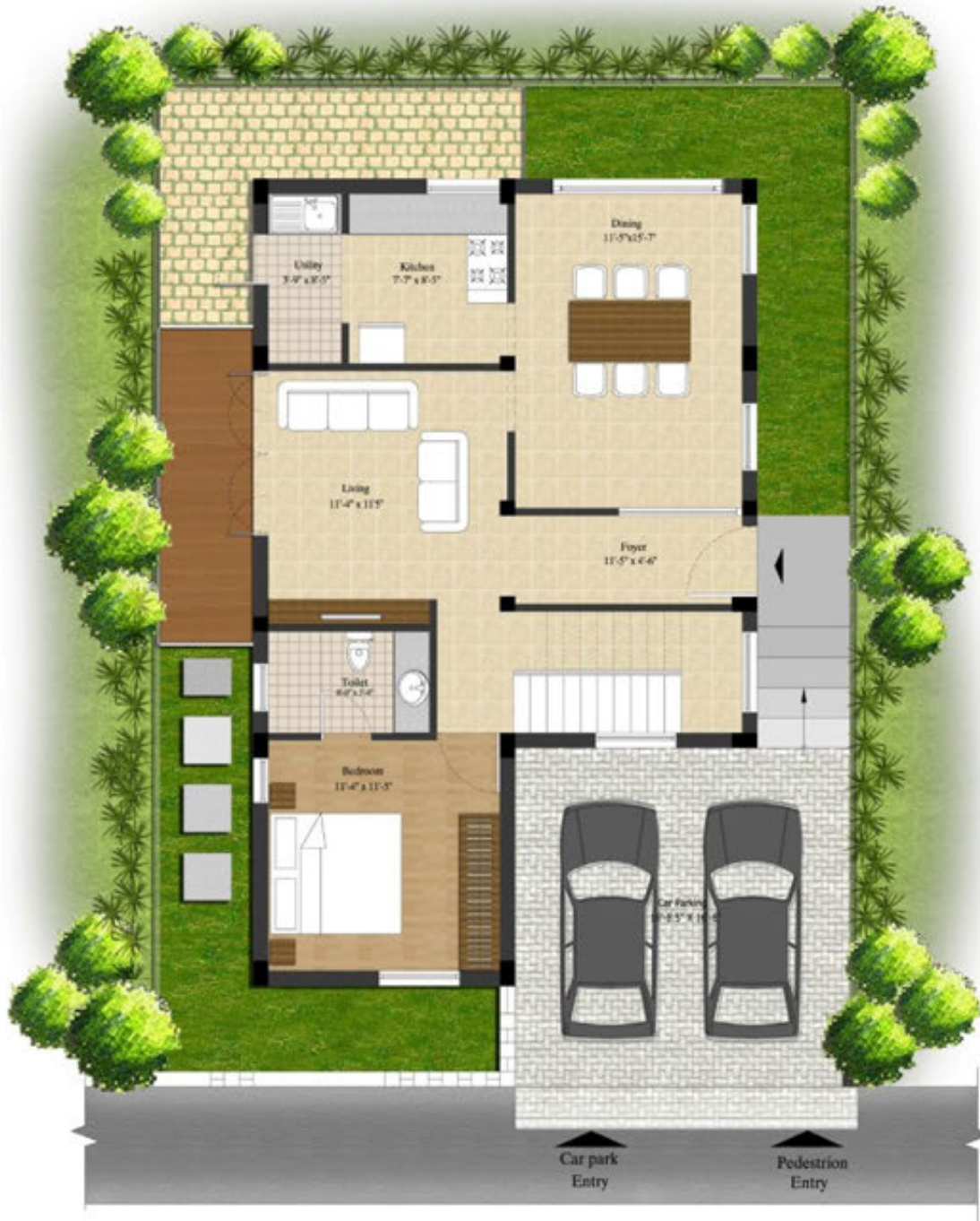
TYPE –B SOUTH FACING GROUND FLOOR