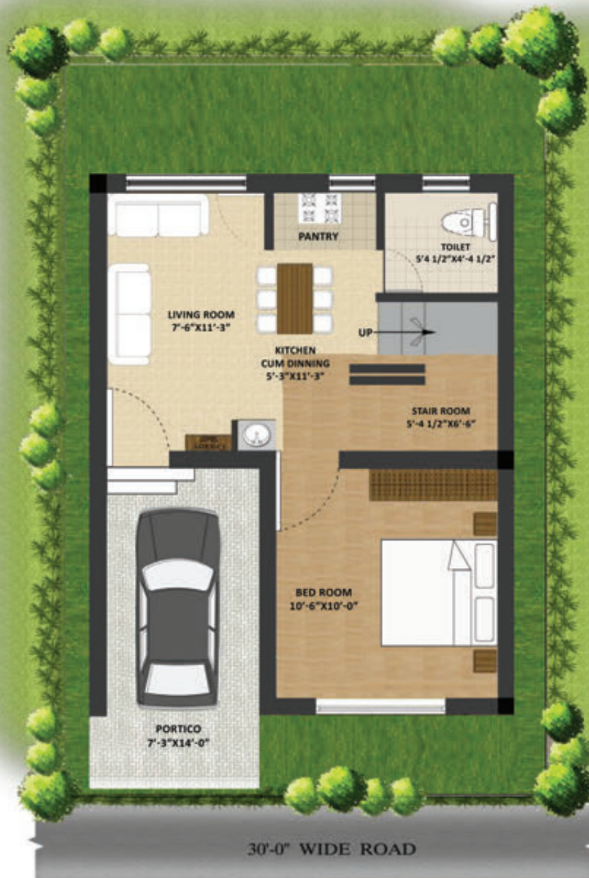
TYPE - EWS 2 WEST FACING GROUND FLOOR