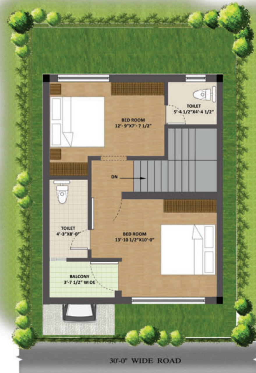
TYPE - EWS 2 WEST FACING FIRST FLOOR