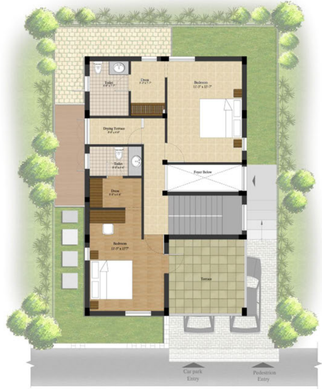
TYPE –B SOUTH FACING FIRST FLOOR