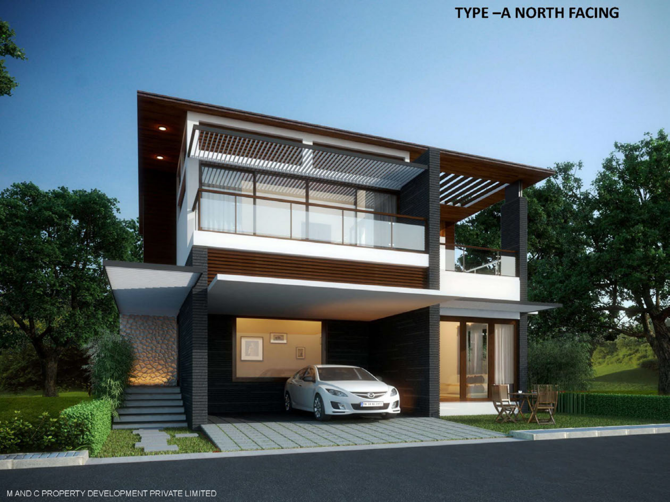
TYPE -A NORTH FACING