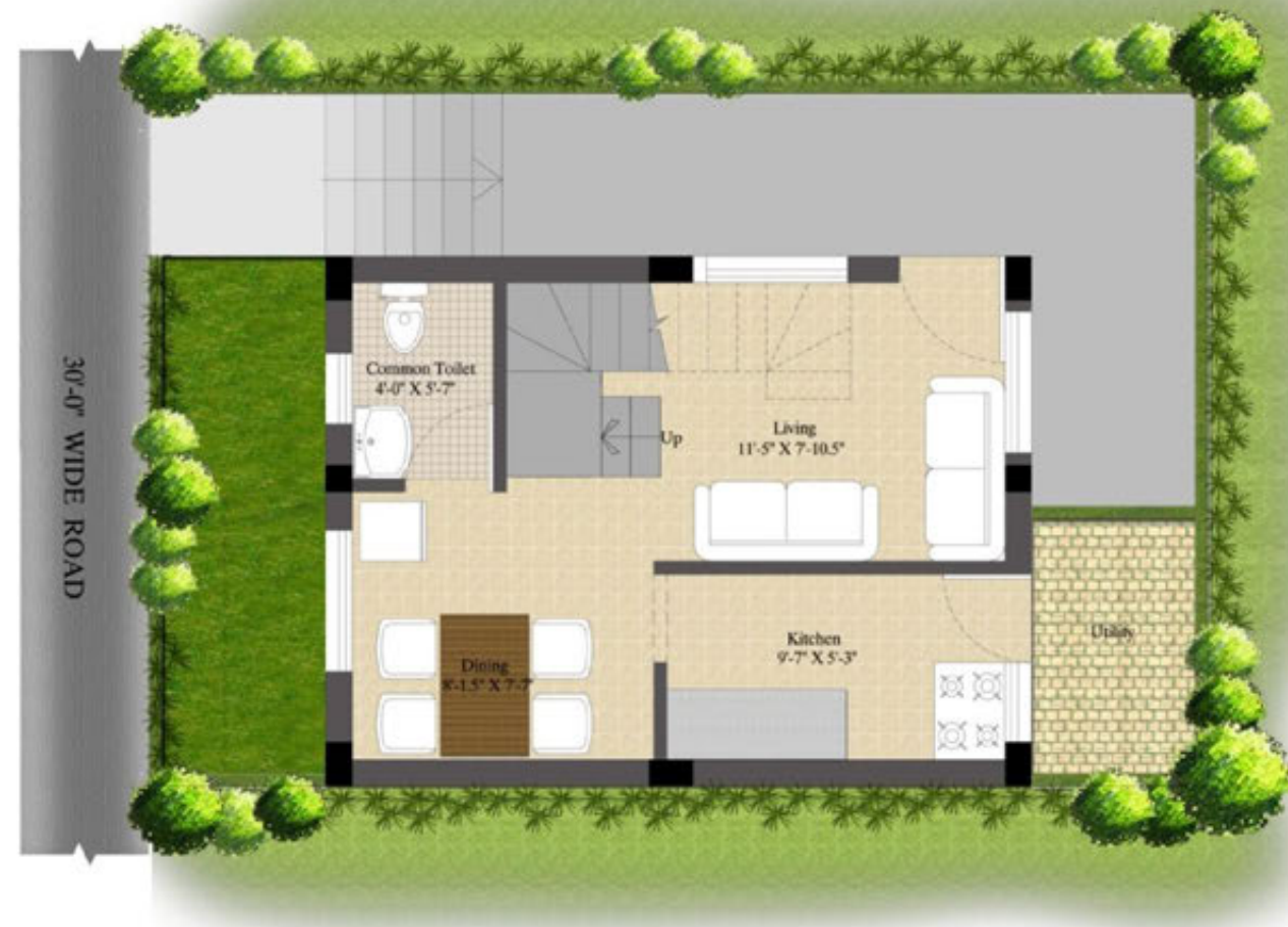
TYPE -E1 WEST FACING GROUND FLOOR